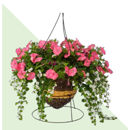
14" BEEHIVE HANGING BASKET