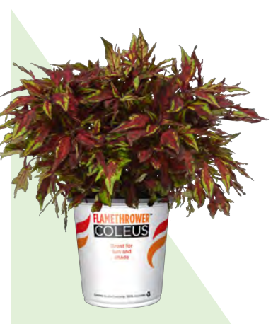
1 GAL FLAMETHROWER® COLEUS