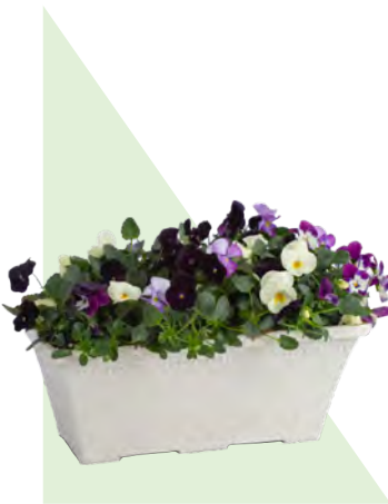
15" COOL WAVE® PANSIES