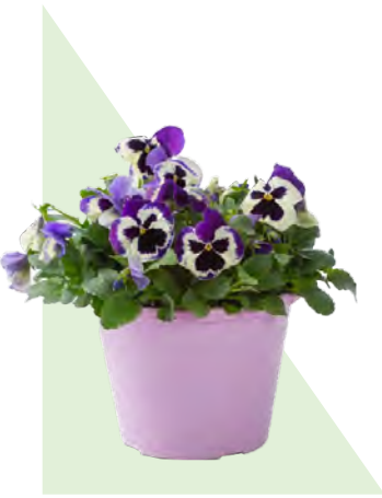
8.5" COLOR POT PANSY