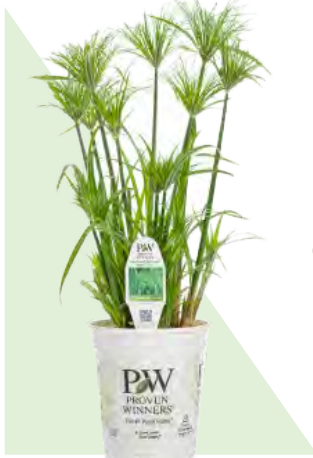
1 QUART GRACEFUL GRASSES®