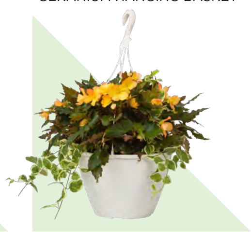
12" SELF-WATERING HANGING BASKET