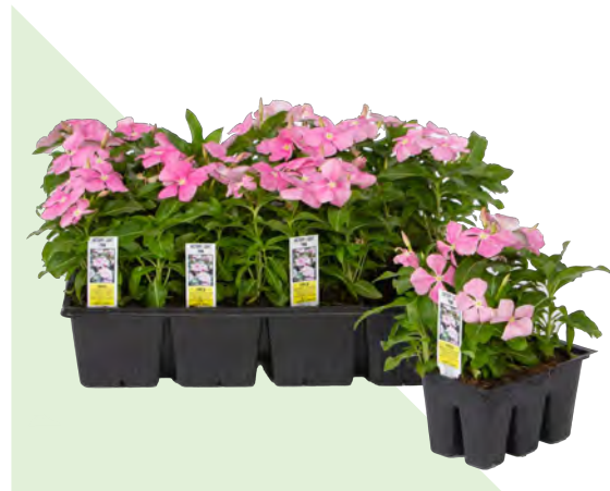
806 ANNUAL PACKS