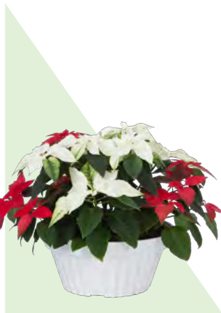
11" POINSETTIA PRINCETTIA BOWL