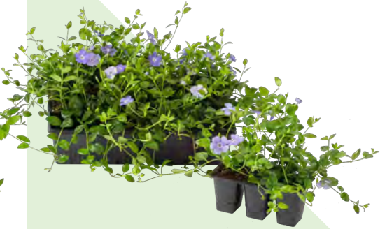
FULL FLAT MYRTLE