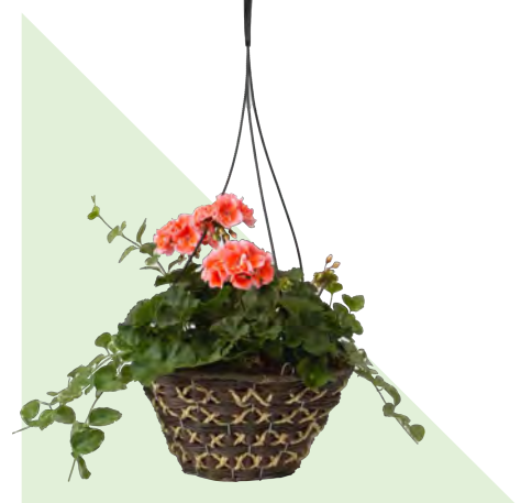
12" PREMIUM WICKER HANGING BASKET