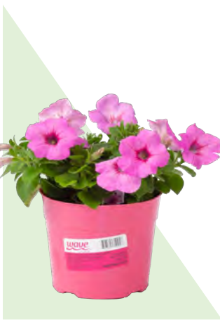
6" WAVE® PETUNIAS