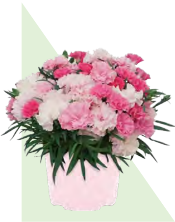
6" I LOVE YOU CARNATION