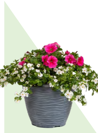
13" PREMIUM ANNUAL COMBO