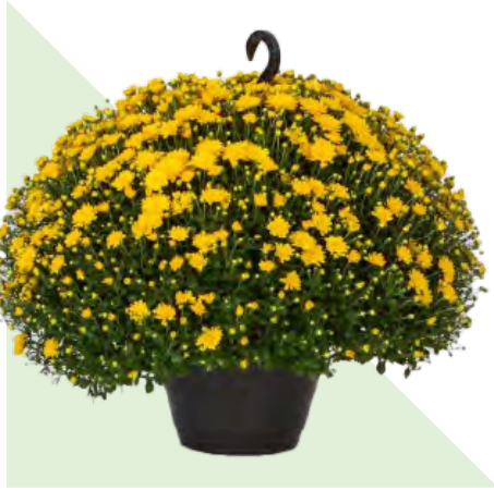
10" MUM HANGING BASKET