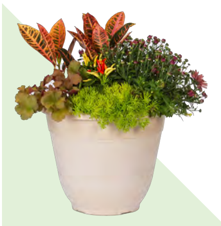
14" FALL COMBO