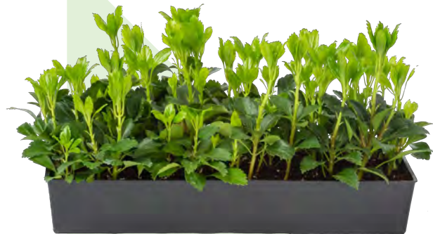
HALF FLAT PACHYSANDRA