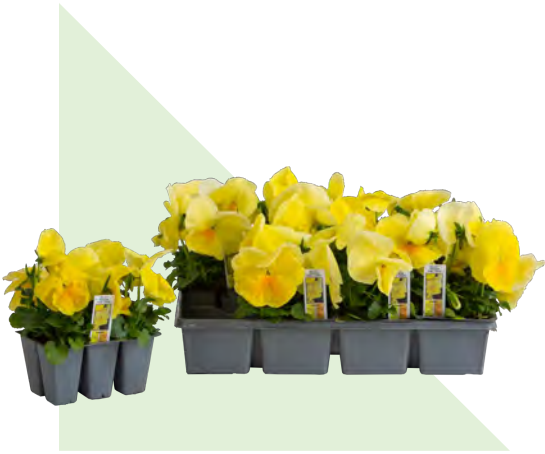
806 PACK PANSY & VIOLAS