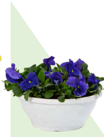
12" PANSY & VIOLA BOWL