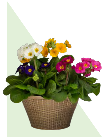
12' PRIMROSE BOWL