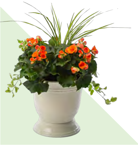
12" URN COMBOS