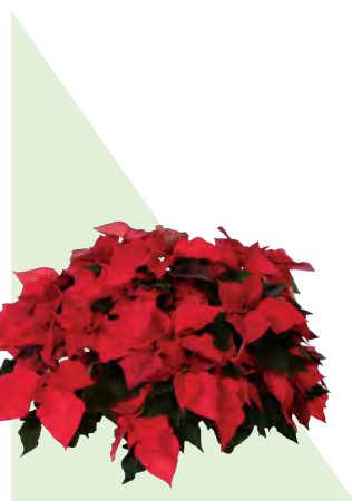
10" BELDON POINSETTIA HANGING BASKET