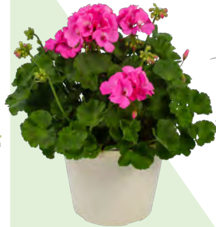
8.5" PREMIUM WINCHESTER