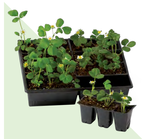
803 PACK STRAWBERRIES