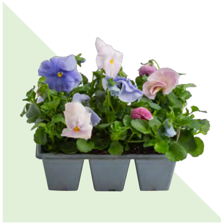
306 PACK PANSY & VIOLAS