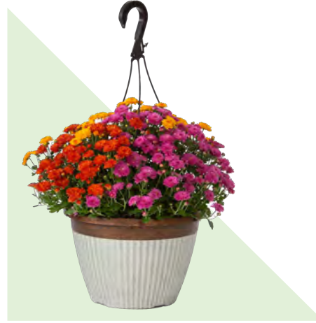
11" TRI-COLOR MUM HANGING BASKET