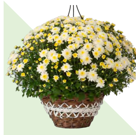
12" WICKER HANGING BASKET