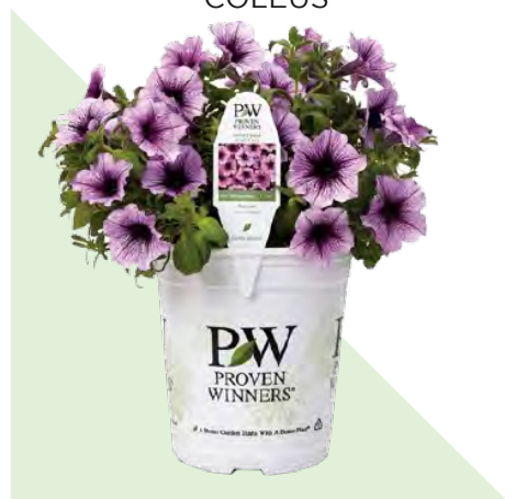
1 GAL PROVEN WINNER®