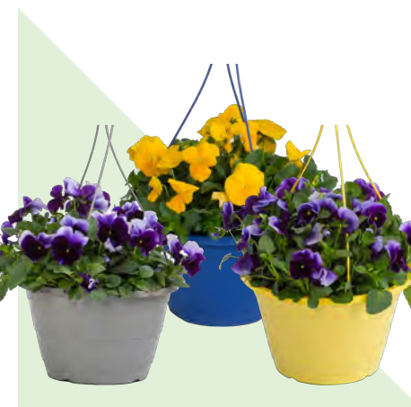
10" PANSY HANGING BASKETS