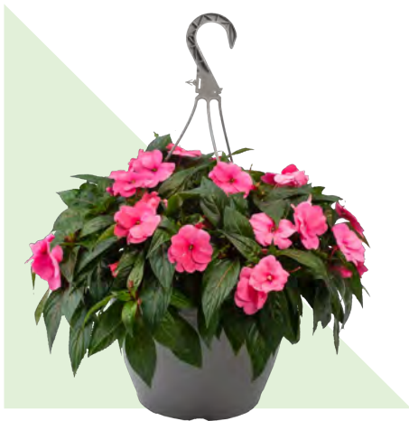
11" PREMIUM HANGING BASKET