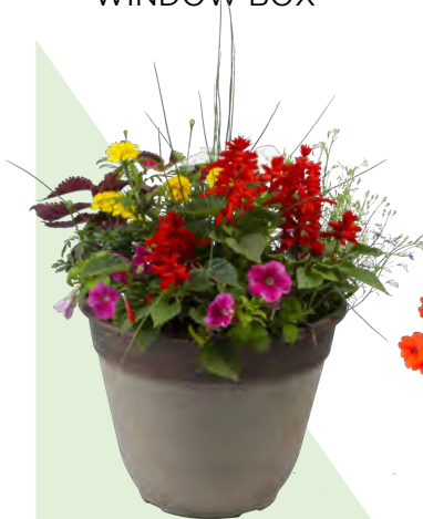
14" QUARTZITE COMBO PLANTER