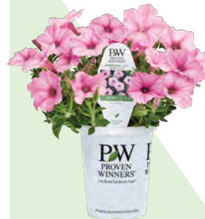
1 GALLON PROVEN WINNER®