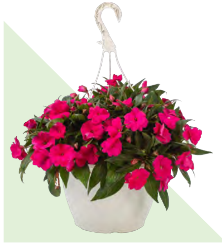
11" PREMIUM HANGING BASKET