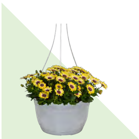
11" OSTEOSPERMUM HANGING BASKET