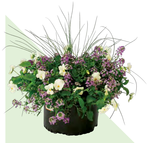
10" EARLY SPRING COMBINATION