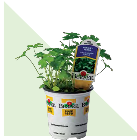
3.5" BURPEE® HERBS