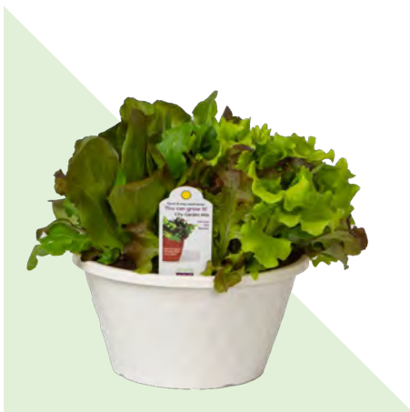
11" SIMPLY SALAD® LETTUCE BOWLS