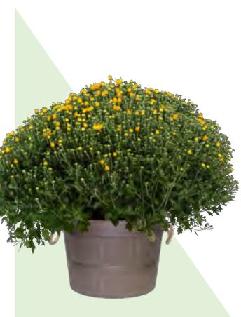
BUSHEL BASKET MUM