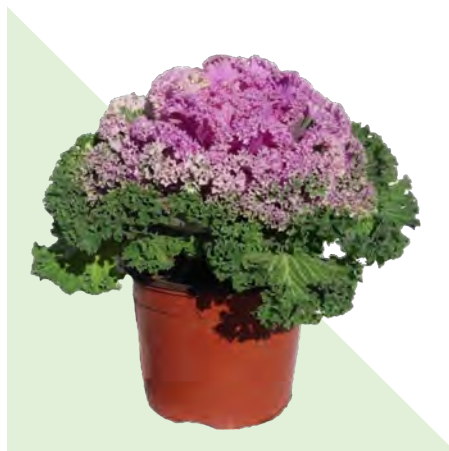
8" CABBAGE & KALE