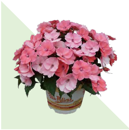
1 QUART SUNPATIENS®