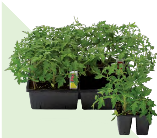
804 VEGETABLE PACKS