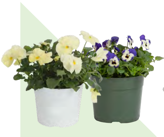
6" PANSY & VIOLAS