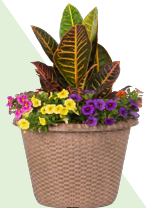
12" EASTLAKE SUMMER PLANTER