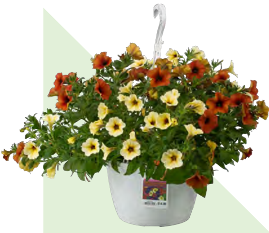
1.5" SUPER CAL® HANGING BASKET