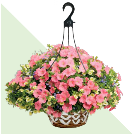
12" PROVEN WINNER® WICKER HANGING BASKET