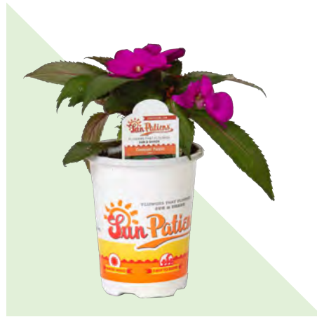
1 GAL SUNPATIENS®