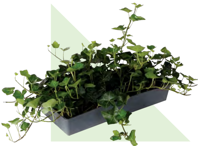
HALF FLAT IVY