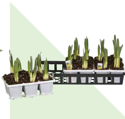
306 PACK BULB