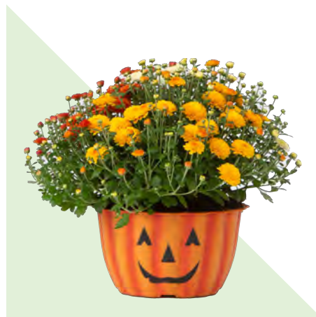
8" MUMKIN PLANTER