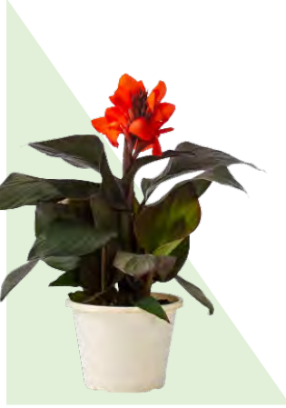
8" MOJAVE CANNA