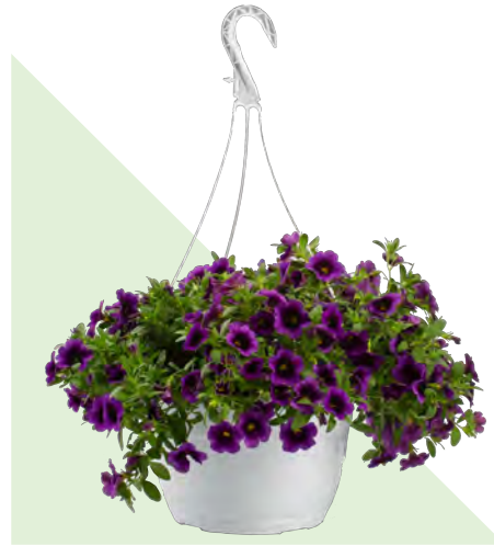
11" PROVEN WINNER® HANGING BASKET