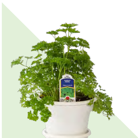
6" BURPEE® DECO POT W/SAUCER