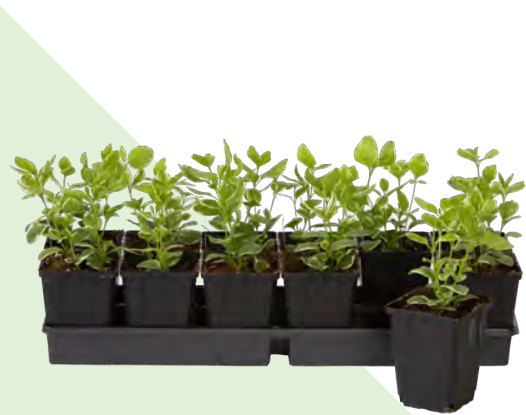
3.5" VINCA VINE