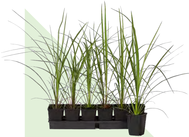
3.5" DRACAENA SPIKES