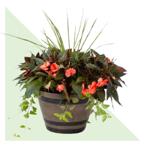
15" WHISKEY BARREL COMBOS