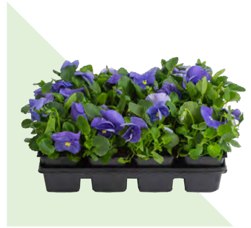
4" PANSY & VIOLAS