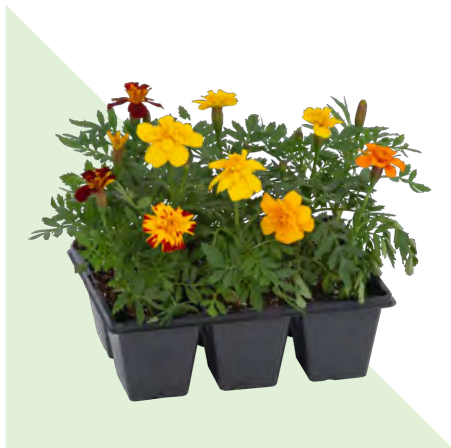
306 ANNUAL PACKS