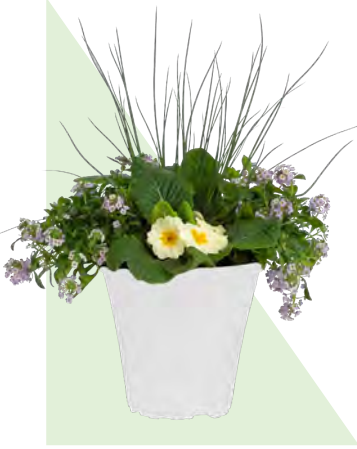
1.5 GAL EARLY SPRING COMBO