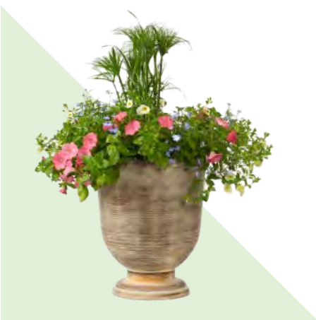
16" PROVEN WINNER® URN COMBOS