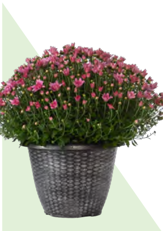
13" MUM MONO