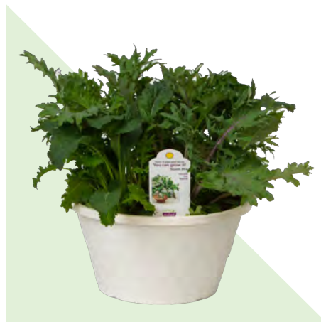
11" SIMPLY SALAD® KALE BOWLS