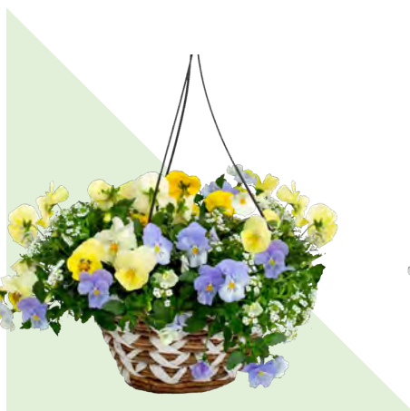
12" WICKER COMBO HANGING BASKET