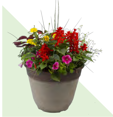
14" QUARTZITE COMBO