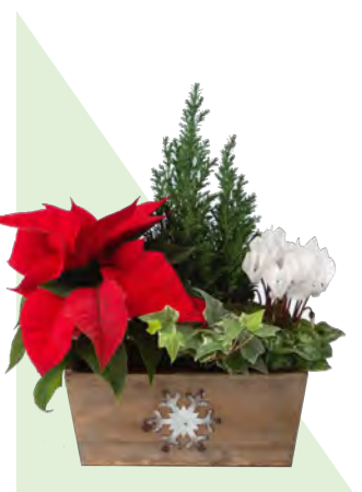
WOODEN BOX POINSETTIA COMBO