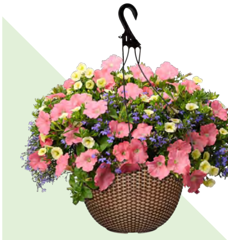
14" PROVEN WINNER® EASTLAKE HANGING BASKET