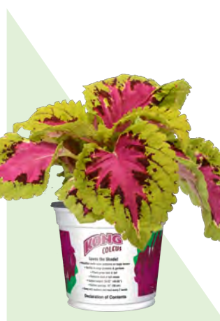
1 GAL KONG COLEUS®