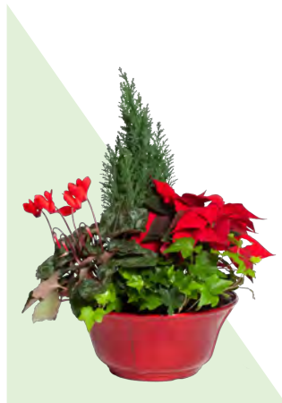
11" POINSETTIA BOWL COMBO