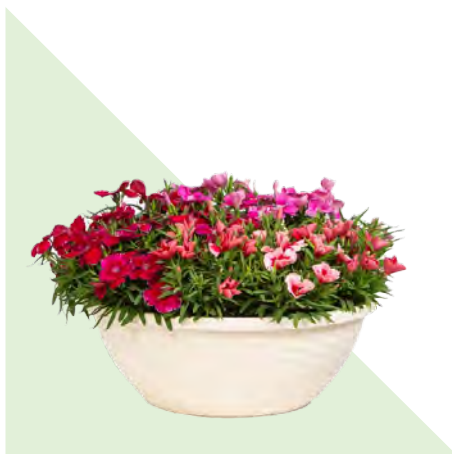
17" DORADO DIANTHUS BOWL