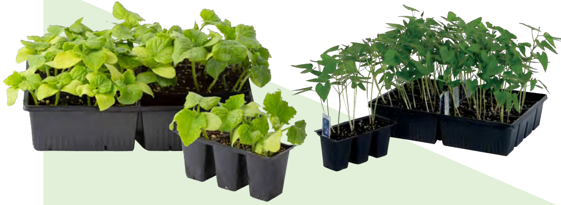
803 SPECIALTY PACKS