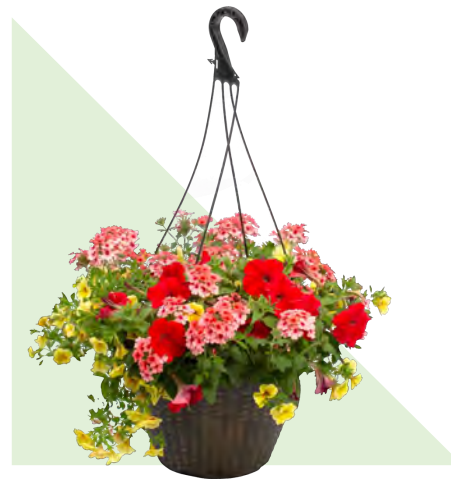
12" PREMIUM HANGING BASKET