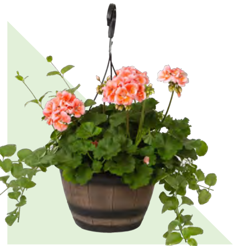
10" WHISKEY BARREL GERANIUM HANGING BASKET