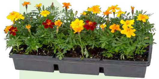
306 PACK ANNUALS