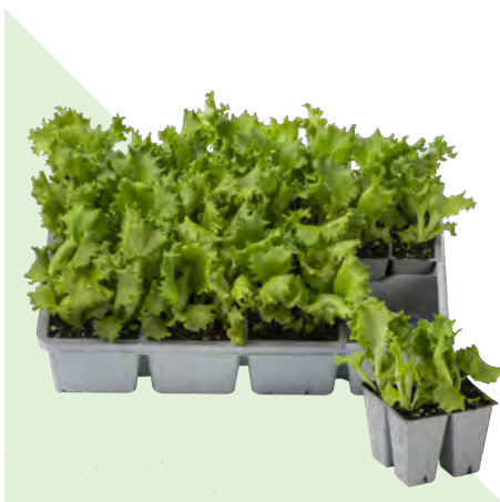
804 COOL WEATHER VEGETABLES