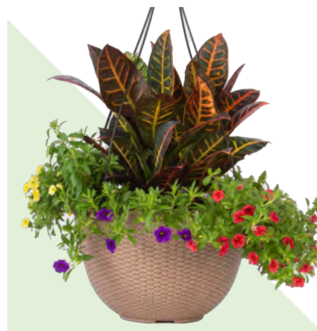
12" EASTLAKE SUMMER HANGING BASKET