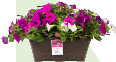
15" WAVE® WINDOW BOX