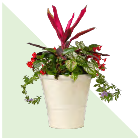
16" FLAIR PLANTER COMBOS