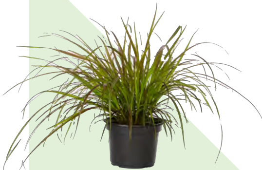
7.5" FALL GRASS