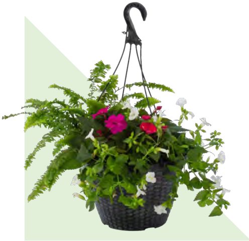
12" PREMIUM HANGING BASKET