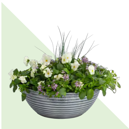
17" DORADO COMBO BOWL