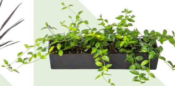
HALF FLAT MYRTLE