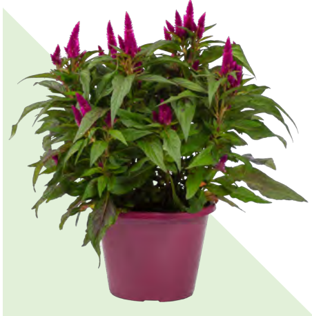
8" COLOR POT CELOSIA