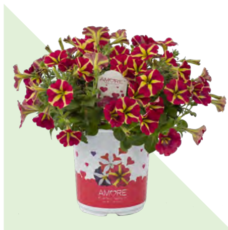
1 GAL AMORE® PETUNIA