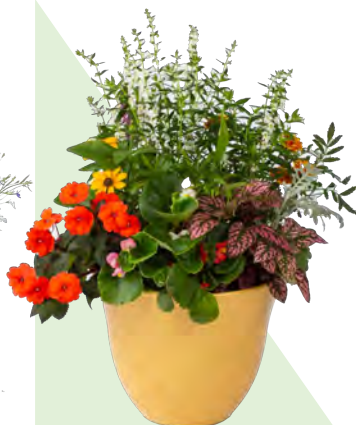
13" HONEYSUCKLE POT