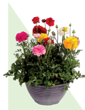
12" RANUNCULUS BOWL