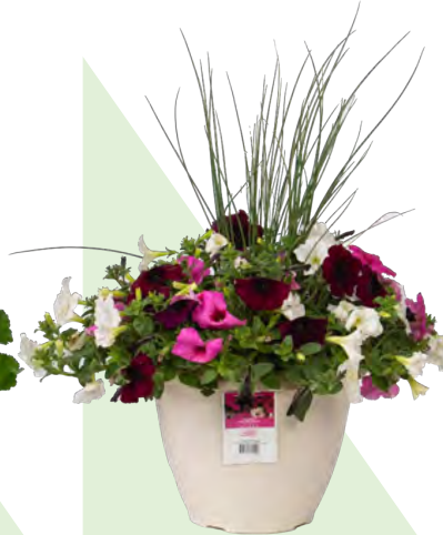
11" WAVE® PETUNIA POT