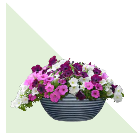
17" DORADO BOWL WAVE® PETUNIAS