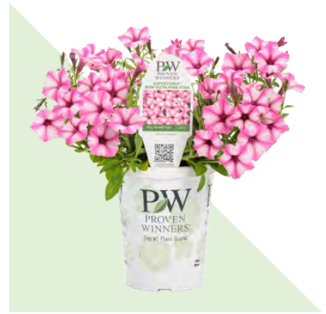
1 QUART PROVEN WINNER®