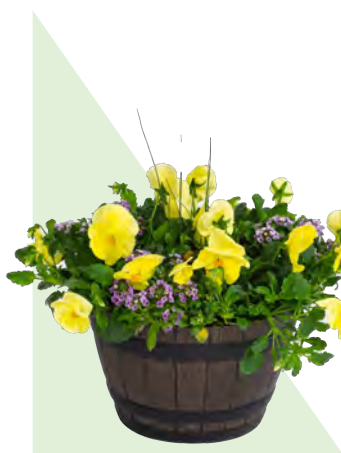
8" WHISKEY BARREL