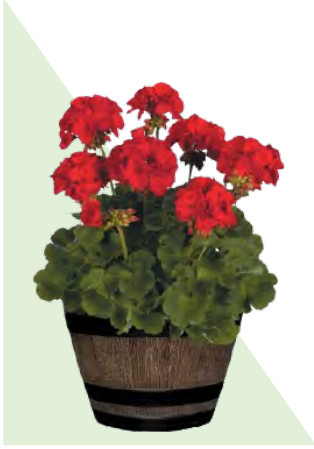
8" WHISKEY BARREL GERANIUM