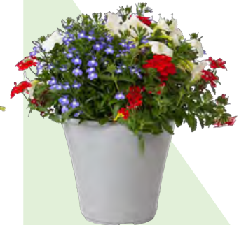
1.5 GAL SUMMER COMBO