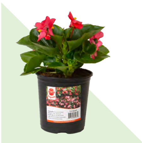
1 GAL BIG BEGONIA®