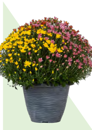
13" MUM TRIO