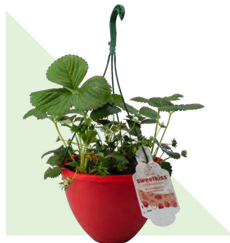
10" STRAWBERRY HANGING BASKET