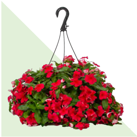
10" BASIC HANGING BASKET