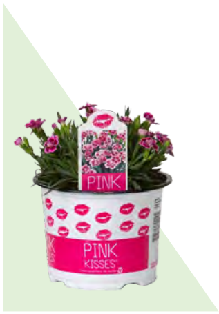
6" PINK KISS® DIANTHUS