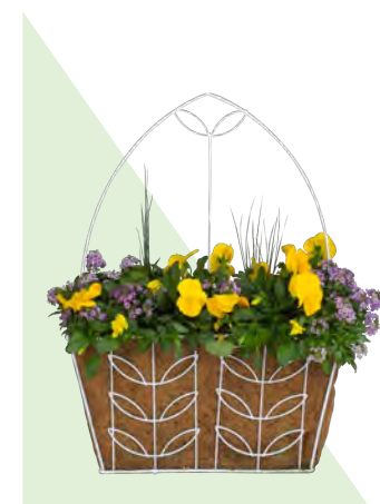
13" WALL PLANTER