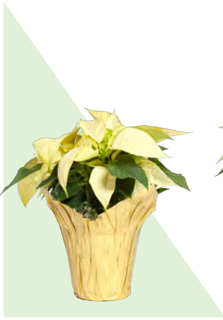
6.5" PRINCETTIA POINSETTIA