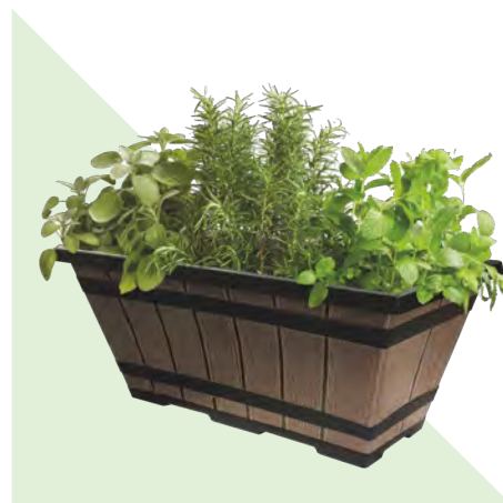
12" BURPEE® NAPA WINDOW BOX HERBS