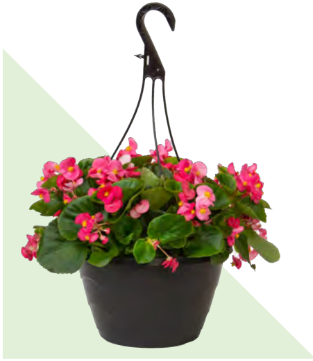
10" BASIC HANGING BASKET