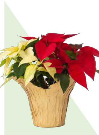
6.5" BICOLOR POINSETTIA