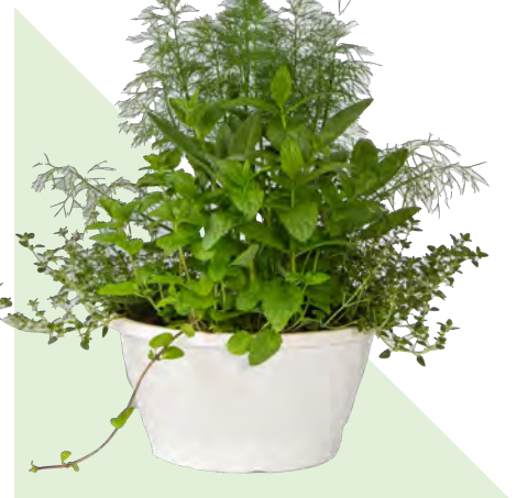
11" HERB COMBO BOWL