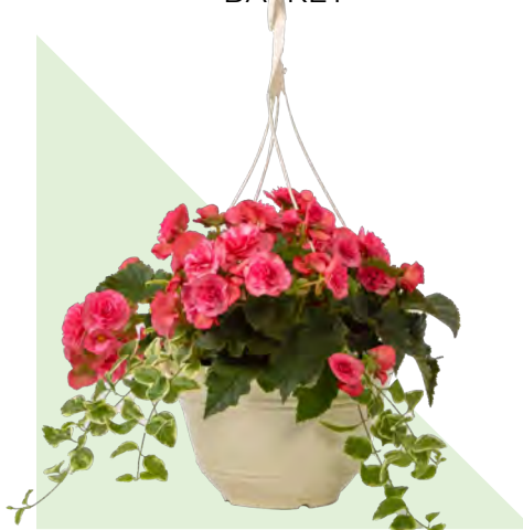
12" CARRARA HANGING BASKET