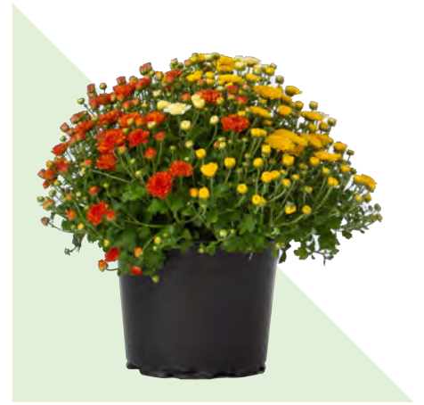
8" TRI-COLOR MUM