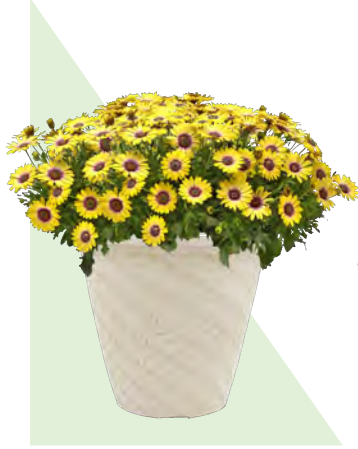
1.5 GAL OSTEOSPERMUM