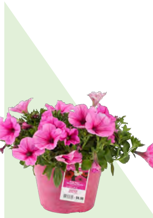
8.5" PREMIUM ANNUALS