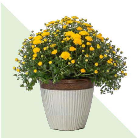
8" MUM PLANTER