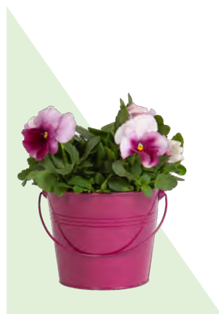
6" SPRING TIN PANSY