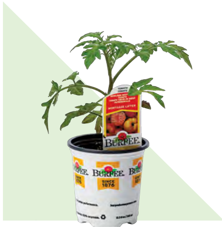
3.5" BURPEE® VEGETABLES